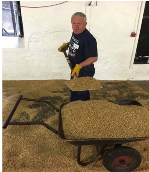
Me, working at the Springbank whisky school