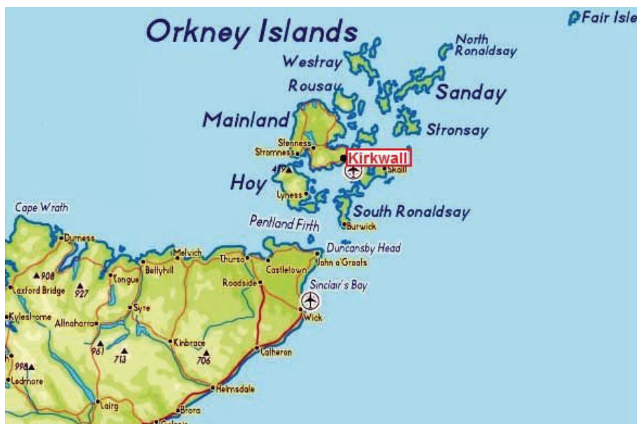
Orkney Islands with the Scottish mainland below left.

It was subsequently annexed to the Scottish Crown in 1472, following the failed payment of a dowry for James III's bride, Margaret of Denmark. Orkney contains some of the oldest and best-preserved Neolithic sites in Europe, and the "Heart of Neolithic Orkney" is a designated UNESCO World Heritage Site.